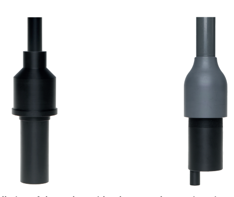
Typical installation of the probes with adapter and extension pipe.

0012.000624 Swivel mount to fix the probe to a standard handrail on the side of the tank. The supply includes 0012.450043 0012.440040 Hose for automatic air injection. Can be used with TU 8355 only.