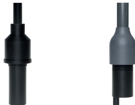
Typical installation of the probes with adapter and extension pipe.

0012.440040 Hose for automatic air injection. Can be used with TU 8325 only.