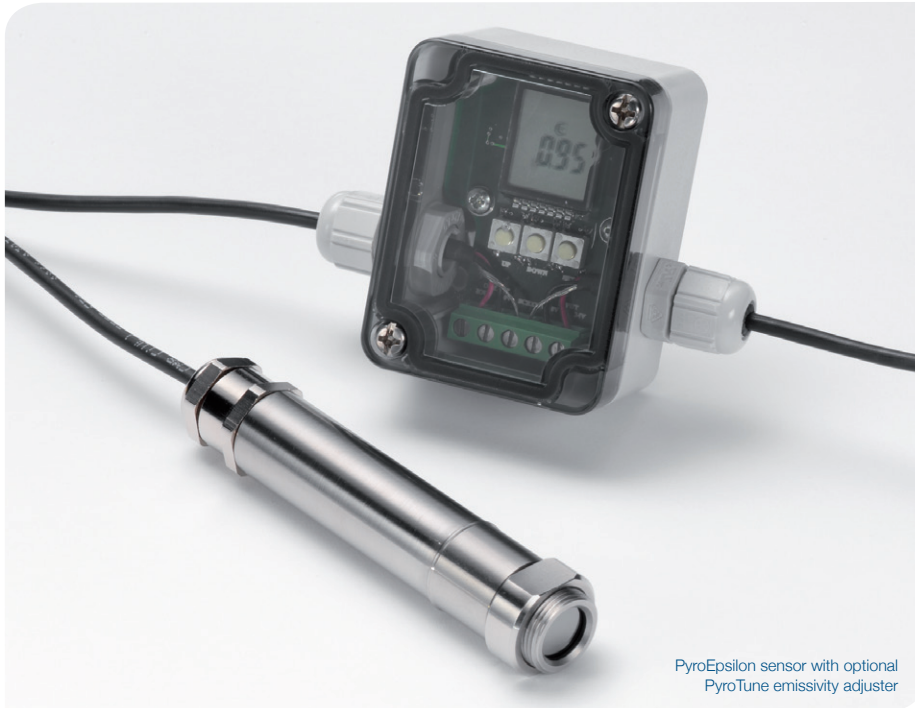
PyroEpsilon sensor with optional PyroTune emissivity adjuster