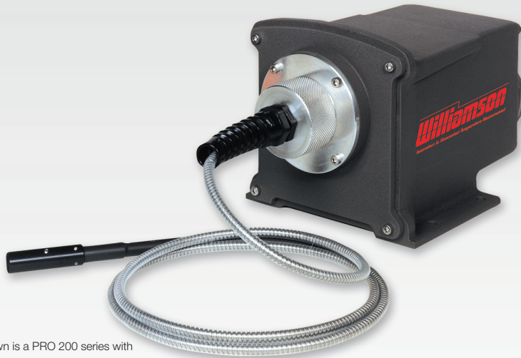
Unit shown is a PRO 200 series with Fibre Optic Sensing Head