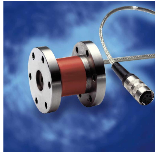
Torque transducer type 0150 RD

For special measuring assignments, the construction of our torque transducers can also be adjusted to the respective applications.