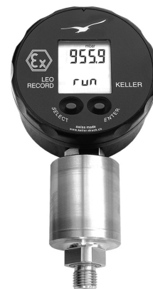
LEO Record Ei with capacitive sensor