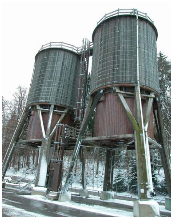
Road salt silo system in Herisau (Outer Appenzell)

Depending on the requirements of the system, the following alternatives are available: